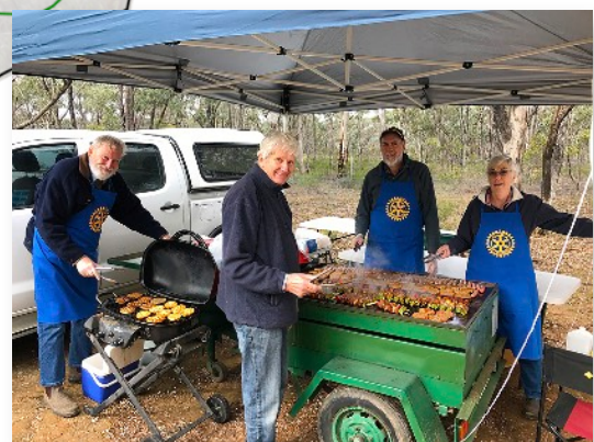
Wonderful lunch prepared by St Arnaud Rotary Club