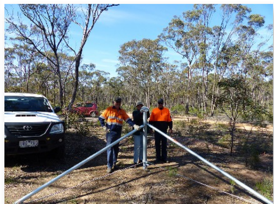
The crew setting up the corner posts for the project.